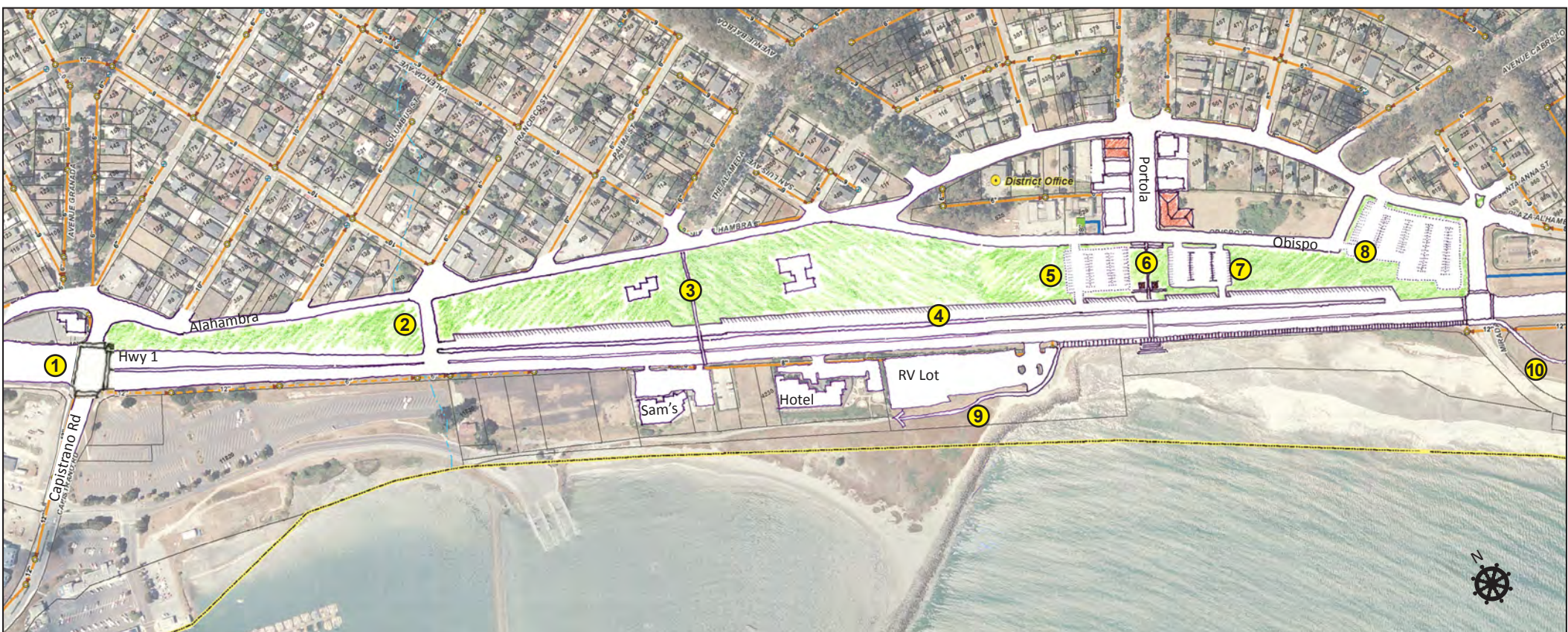
Plan details are illustrated above.